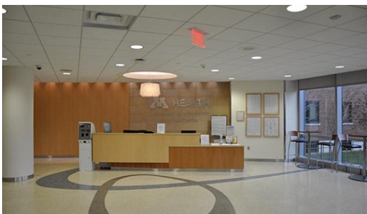
Medical Center information desk at East Building entrance.

Imaging check-in area. Waiting area is past this desk.