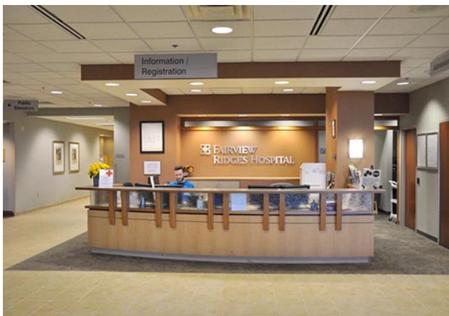
Registration desk inside main hospital entrance.