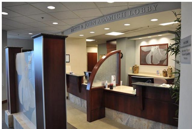
Check-in desk inside Breast Center waiting area, Suite 220.