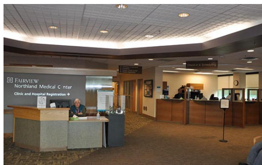
Lobby at main hospital entrance. Check-in desk to the right.