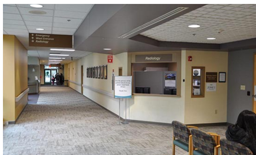
Radiology desk and waiting area.