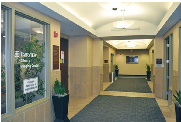
Lobby at front entrance. Imaging Center on the left.