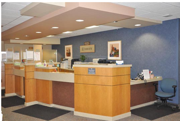
Registration desk in clinic and imaging waiting area.